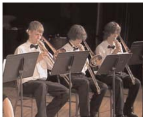
Taconic High School's Jazz Ensemble performs at their spring concert.

access stations across the country could submit their programs in. PCTV judged 3 of the categories; Most Entertaining Talk Show, Best Senior Program and Making a Difference.